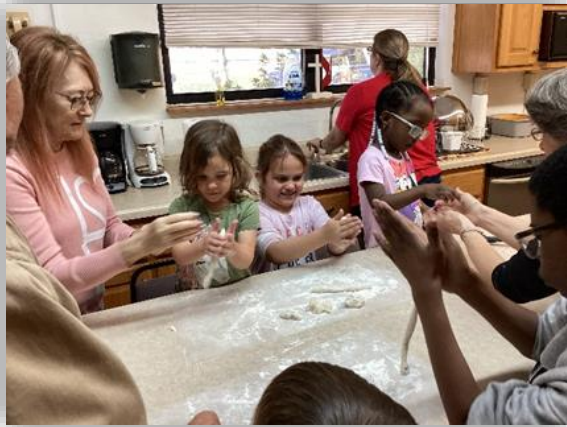
Ash Wednesday – making pretzels to remind us of prayer. Coloring butterflies to remind us that like a butterfly changes Jesus also changes us.