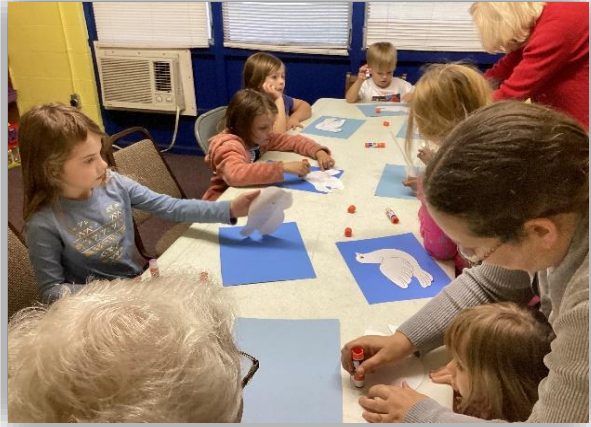
Learning about Jesus' baptism and the dove that God sent to show His approval.