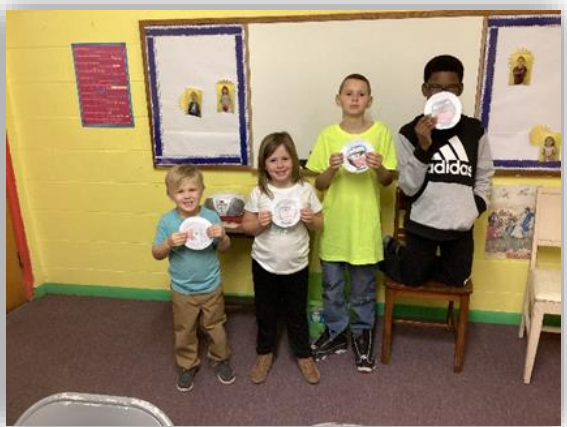
Learning about Jesus' first miracle by creating a craft that shows turning water into wine. Learning about Jesus' first miracle through Bible study.