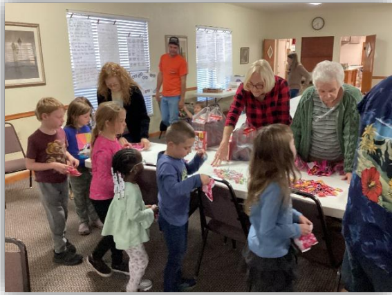
Preparing Valentine bags for the Bread of Life