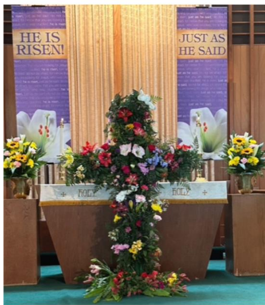
The beautiful Easter Cross.