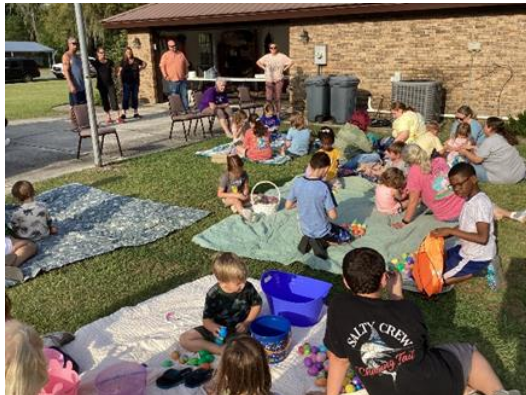
The Easter Egg Hunt.