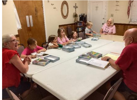
Studying about Philip and the Ethiopian.