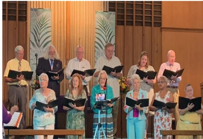
Chancel choir presenting the cantata "The Day He Wore My Crown" on Palm Sunday.