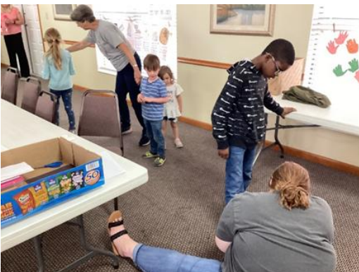
Doing activities to emphasize that Jesus changes us. Knowing that Jesus is the truth.