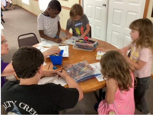
Coloring pictures for Kairos Outside upcoming retreat.

We are looking forward to seeing you on Wednesdays. Come learn and enjoy all the things that God has blessed us with. God Bless!! The Kids' Klub Team