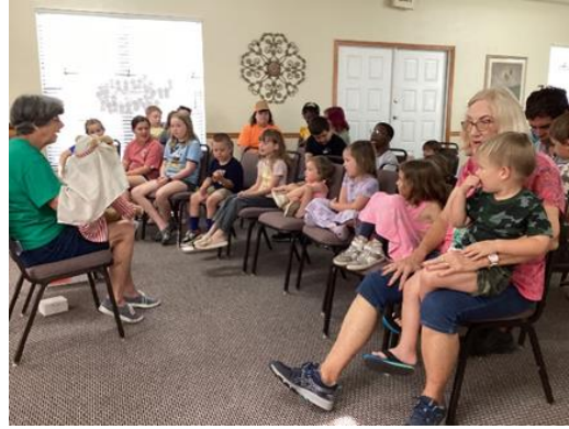
Big "C" the camel sharing about Holy Week.