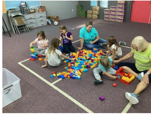
Learning about Saul/Paul and his road to Damascus experience.