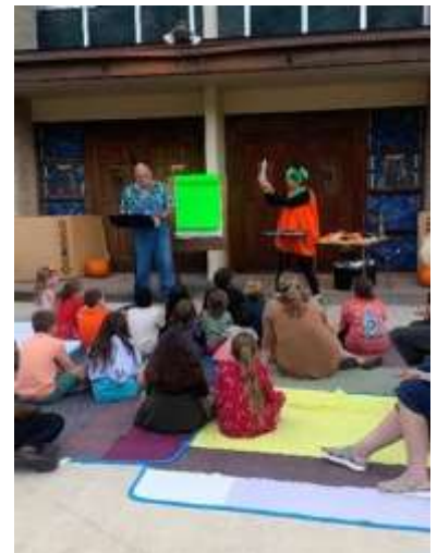
Sharing stories at the Pumpkin Patch on Wednesday night.