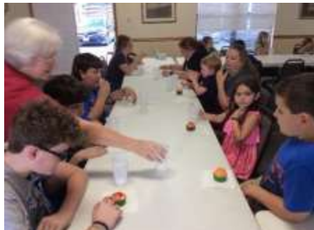
Learning about Moses while we were eating a burning bush for snack.