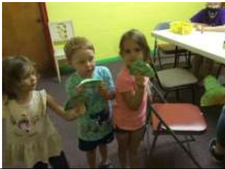
Baby Moses in the basket ready for the Nile River.

We thank you for all the support that you have given us through your prayers, your time, and your monetary donations. God has truly blessed us. If you are three years and up, we are looking forward to seeing you on Wednesdays. Come learn and enjoy all the things that God has blessed us with. God Bless!! The Kid's Klub Team