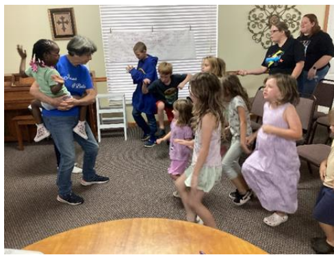
Learning about the first person to see Jesus after He arose from the tomb.