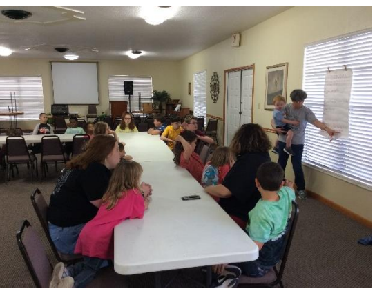
Learning scripture and choral reading of the scripture