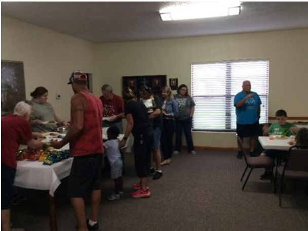
Family Night with Kids' Klub eating Tacos