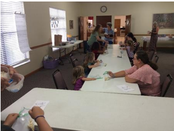
Learning how God created the world through our creative snacks.

September is here and we are so excited to be learning about “The Family of God” through Abraham. We are looking for you to join us as we learn about, share, and serve Jesus. We hope that you will join us on Wednesdays from 5:00 to 7:00. Come learn and enjoy all the things that God has blessed us with. God Bless!