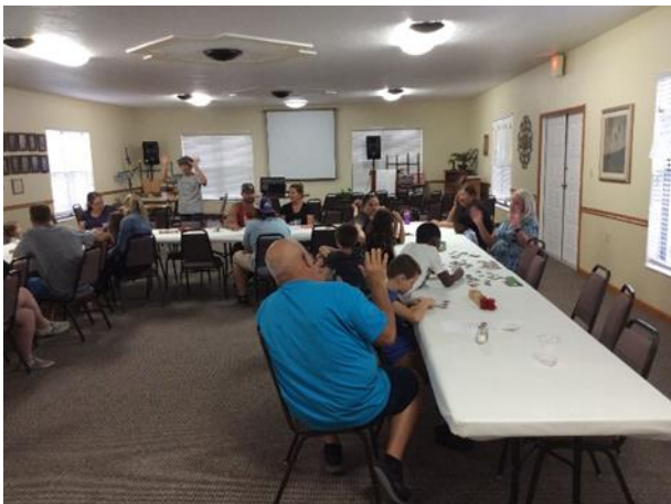
Family Night Singing