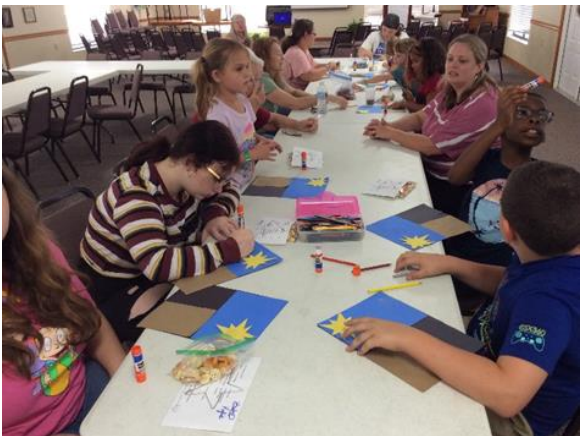
Crafting the Creation story with a panel for each of the six days.