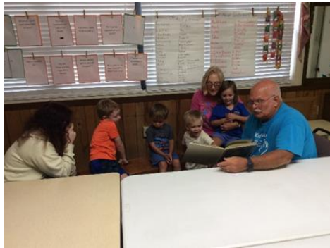
Playing bingo to learn about Abraham with the answers being the boxes on the bingo card.