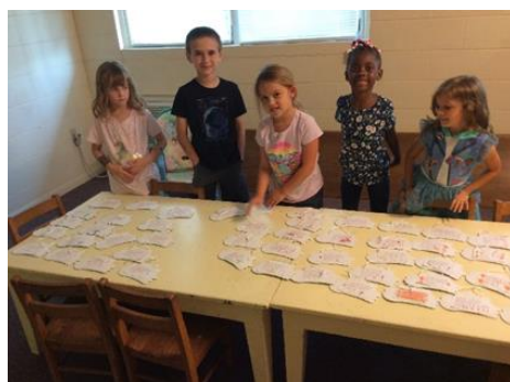
Making cards to mail to the church family to remind them of God's blessings during this Fall Season.