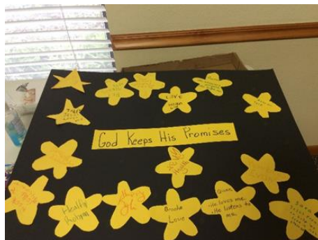
Making stars to remind us God's Promise is still there today.