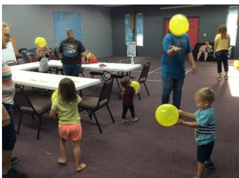
Herding sheep (aka yellow balloons) as Abraham herded his sheep to another land.