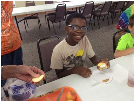
Making a camel's mouth out of apples, peanut butter, and marshmallows to remind us Abraham obeyed God and took his camels, family and possessions and followed where God sent him.