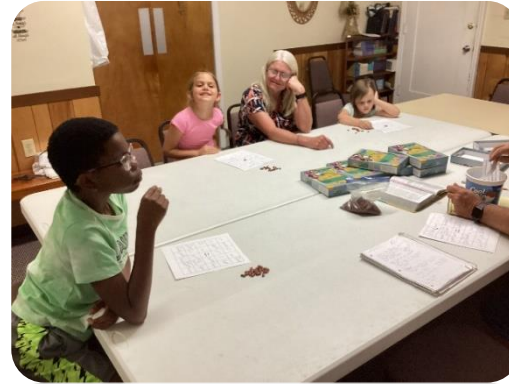
Learning about Lydia and her faith in Jesus.