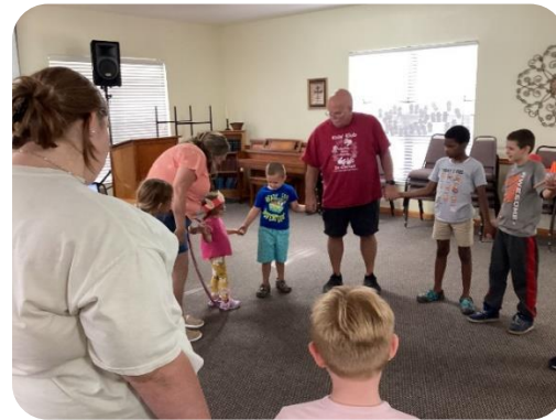
Celebrating Pentecost in wishing the church a "Happy Birthday."