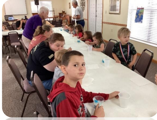
Learning about Jesus' Ascension and how we should follow the "son" through snack and making a sunflower.