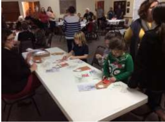
A celebration of Christmas Joy