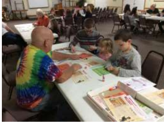
Learning about "The Christmas Family"