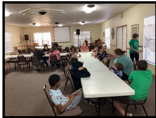
Learning our Bible verse.