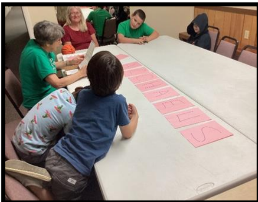
Learning about Zacchaeus.