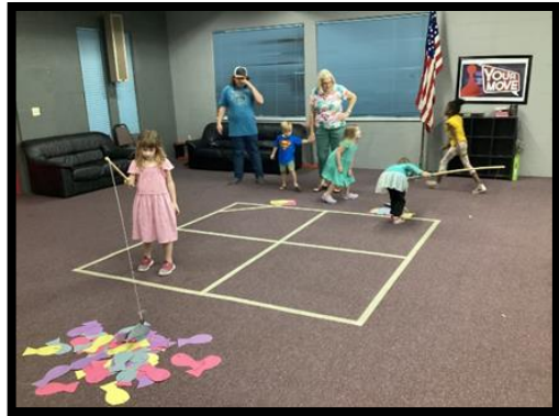
Learning about Jesus choosing His disciples