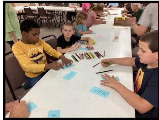
Ash Wednesday, a time to focus on prayer as we made pretzels. We also focused on others as we prepared our mailouts.