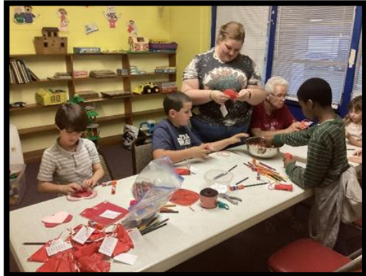
Jesus wants us to give from the heart like the widow did with her mites.