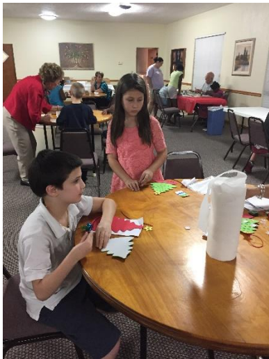
Working on crafts at the Advent Workshop

As we begin this new year with Kids' Klub I would like to take time to thank all of you that have taken your time and effort to make Kids' Klub such a great place to be. Thank You to all that helped with the Advent Workshop. What an awesome way to begin the season. It is with a humble heart that I send a big "THANK YOU" to those that attended the Children's Christmas Cantata. Your support was Amazing and the children were so proud. You made them feel special and a true blessing for God. We are so blessed by your prayers, your support and your donations but most importantly by your love. We are looking forward to a great new year filled with Jesus and His wonderful stories and truths. If you are a kid between three years old and fifth grade come and see what blessings God is showing us. We will learn about Jesus, play games, sing, and pray together. Supper will be served each week. We are looking forward to seeing you from 5:00 to 7:00 each Wednesday afternoon.