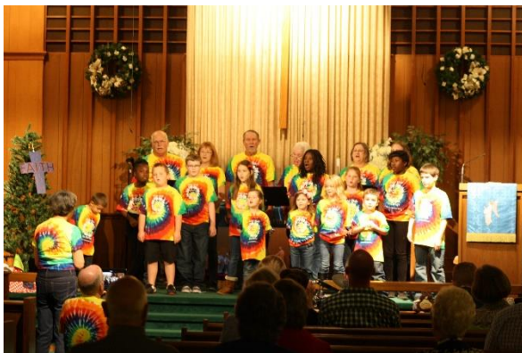
The Kids' Klub Cantata