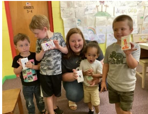
Bartimaeus helped us to think of all God does for us. Jesus is our light.