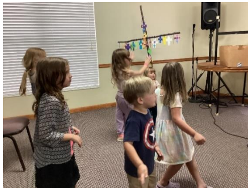
Learning about Passion Week by making an egg with Christian symbols on it and singing His praises.