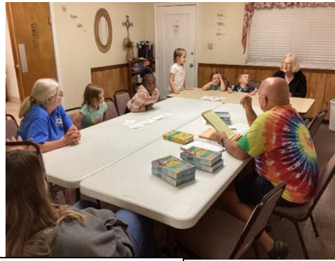
We were reminded how much Jesus loves us with study and cookies to reflect each child's image.