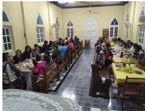
Christmas Dinner with church members and their families.