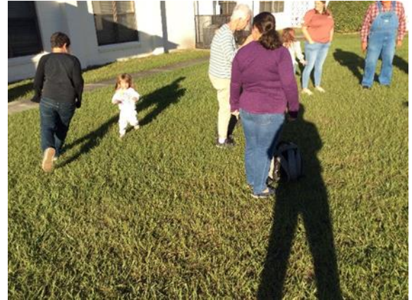
Playing a game to remind us that God loves us.