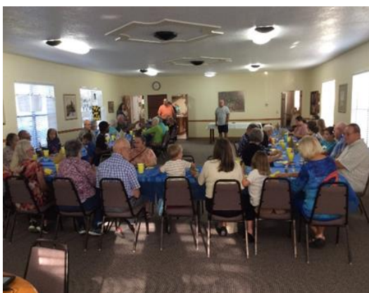
Kids’ Klub Night Out

We thank you for all the support that you have given us through your prayers, your time, and your generous monetary donations. God has truly blessed us. If you are three years and up, we are looking forward to seeing you on Wednesdays. Come learn and enjoy all the things that God has blessed us with. God Bless!! The Kid’s Klub Team