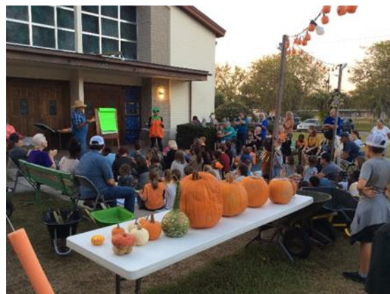
Storytime at the Pumpkin Patch on Wednesday night.