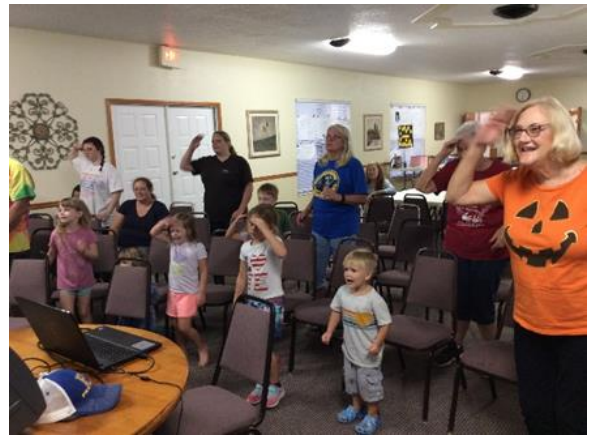
Yes, we are in the Lord's Army