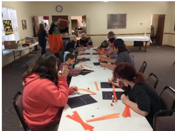
Reminding ourselves through crafts and singing that Jesus is the light which we should share.