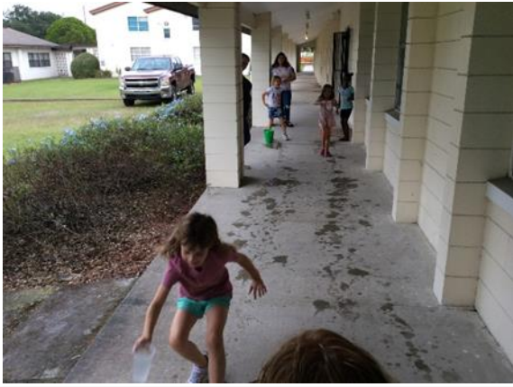
Learning about Rebeka at the well