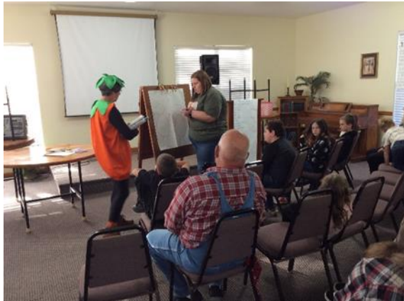
Learning about and discovering the differences between Esau and Jacob