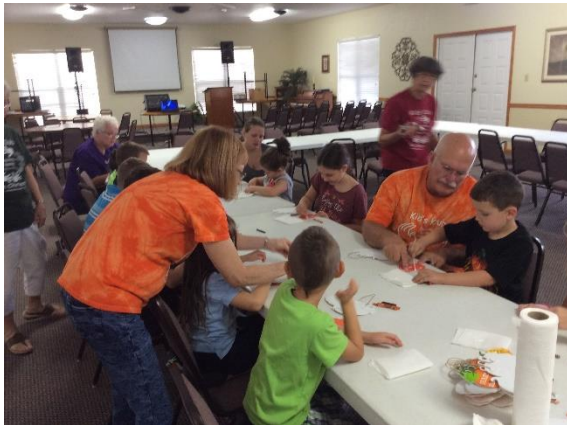
Learning the books of the Old Testament.