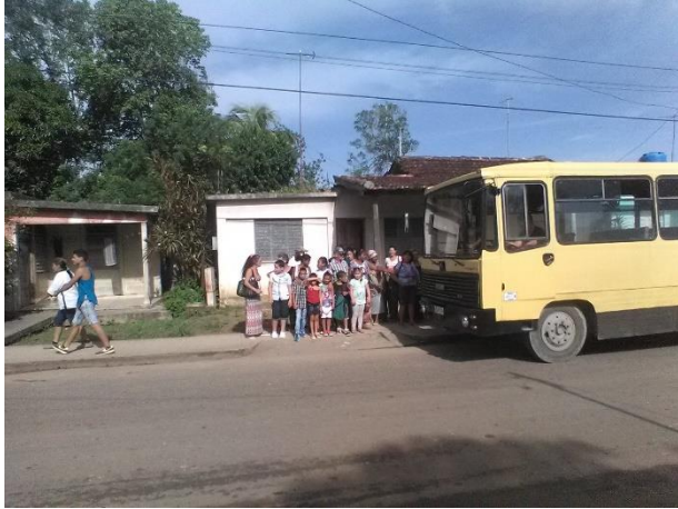
The bus that is being rented to bring people from the outer parts of the area to meet at the San Antonio de Rio Blanco Church.