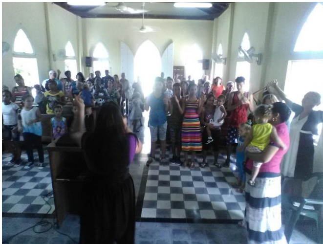
Church service on a recent Sunday morning.