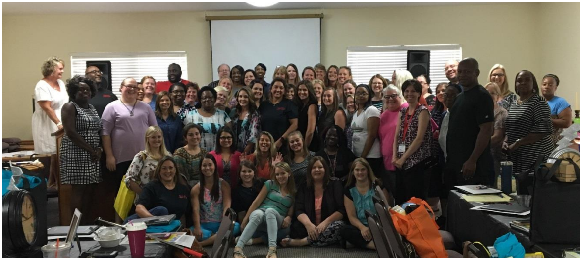
Moseley Teachers at the breakfast sponsored by Trinity UMC in August