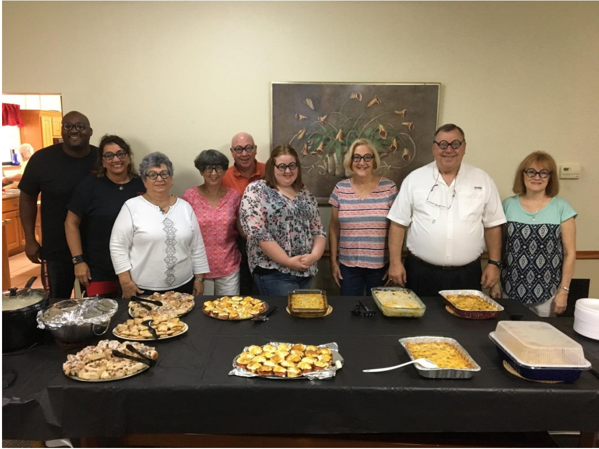
Helpers for the Moseley teacher breakfast at Trinity in August